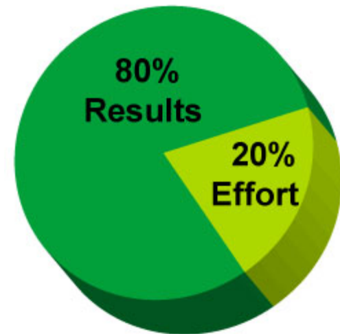
The Pareto Principle

If you manage time effectively you will yield better results in less time.